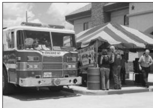
Cowboy Harley-Davidson, 1150 IH-10 south in Beaumont was the perfect location for a recent Saturday membership drive. Special 100 Club member motorcycle decals are now available to members in addition to decals for cars and trucks.

"The 100 Club was started with the purpose of providing death benefits to families of fallen heroes and that is the same focus that we have today," he said.