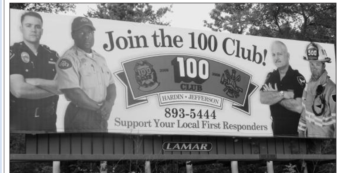
This billboard was designed especially for May Awareness Month, but some billboards displayed the sign for months afterward. The design was also used for yard signs and banners.